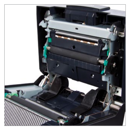
The DB-EA4D features easy paper path access, tool-less maintenance and uses 2 thermal heads to simultaneously print on the front and back sides of a direct thermal label.