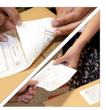
Peel and apply a delivery label leaving the corresponding invoice (or picking list, return policies and procedure, customer survey, etc.) printed on its backing paper.

The intuitive LCD backlit menu allows simple user operation, supported by colour LED notification lights (using colours distinguishable by the visually impaired). Auto-feed functionality enables trouble-free quick paper-loading, and easy maintenance is facilitated with tool-less replacement of key components like the printhead and platen roller.