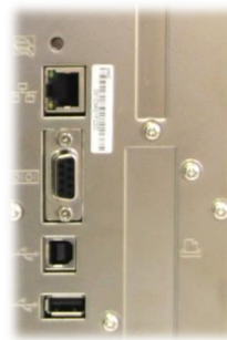
Multiple interface ports standard including 2 Host USB ports