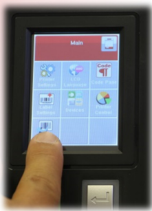
Large color touch screen LCD for easy configuration

The Tharo T-Series is an affordable high-output industrial barcode label printer from the creators of EASYLABEL®