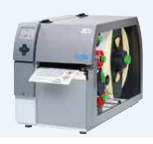
Print modules PX series For integration into automatic labeling systems