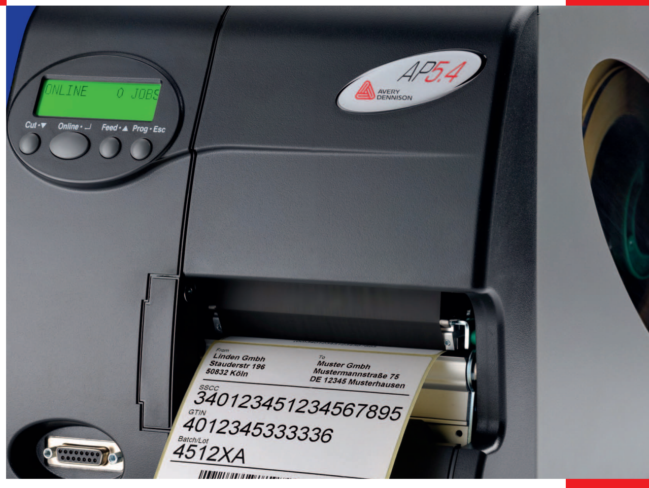
Solutions for an efficient supply chain