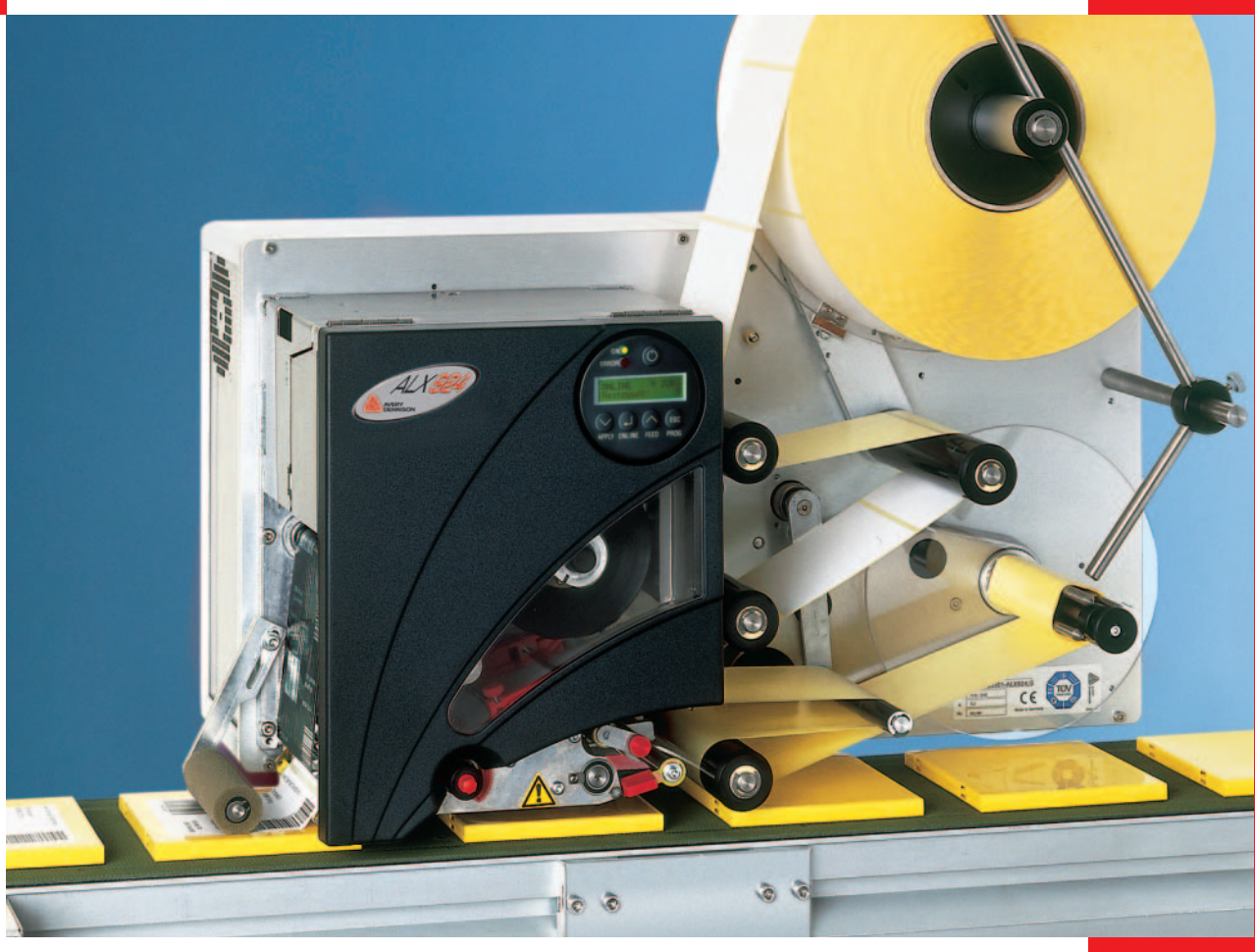
The 1:1 print & apply system for industrial use