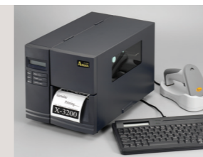
> X Series, Argokee & Scanner