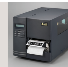
> Dispenser mode