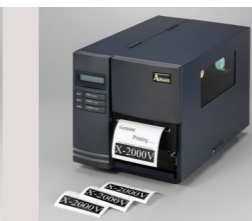
> Cutter mode