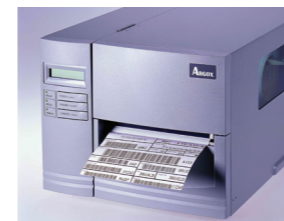
> G-series provides wide 6" printing

The G-6000 offers the industrial standard 6 inch width to give you high speed performance and greater extension of the printing area. Built-in LCD display, 1 MB flash memory, PS/2 interface for your PC keyboard provides the essential structure for Plug and Play stand-alone operation. Perfectly designed metal case resists rough treatment, heat, and dust, and ensures continuous quality operation, even in the most demanding environments. Superior historical control enhances high printing quality, and is perfect for printing of barcode and small alphanumeric. The G-6000 is simple to operate and it is easy for the user to perform adjustments and maintenance.