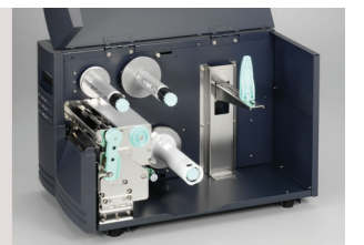
> Inside of X-series